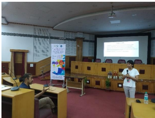
(Bottom) Participants of the Quiz and the Innovative Idea Competitions held as part of World IP Day 2023 celebration.