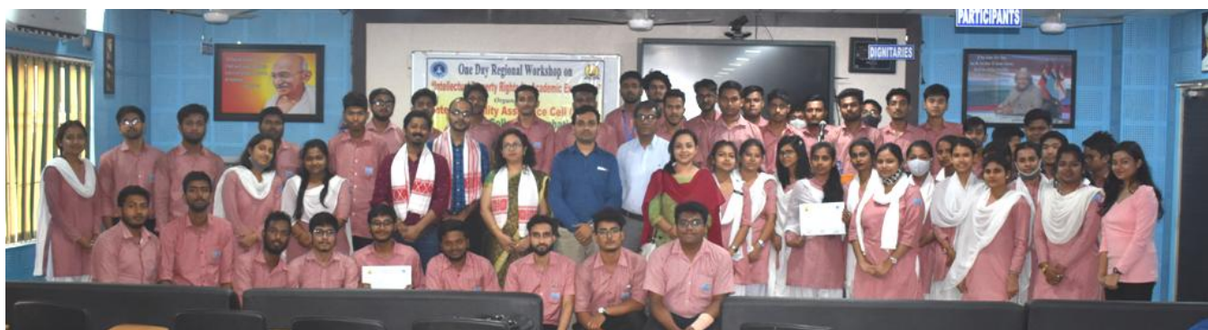
Photo: (Top left) Participants along with the members of the organizing committee from Pandu College, (top right) student participants present in the workshop and (at bottom) the group photo of the participants with the organizer and resource persons at the end of the workshop