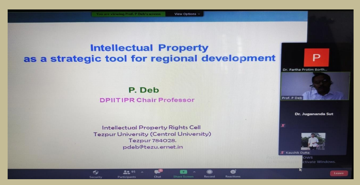
Photo: Screenshot of the Webinar just before the lecture of Prof. P. Deb.

Citing many instances from local to global, the Speaker also focused on how Intellectual Property Rights (IPR) can become the fuel that powers the engine of prosperity, fostering invention and innovation not only in Assam but also in the entire North Eastern region.