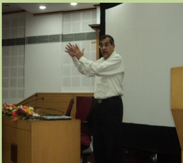
1st Technical session