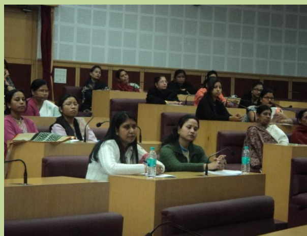
Participants of the Programme