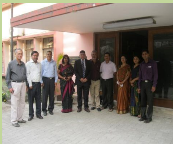
Organising team with one of the resource persons