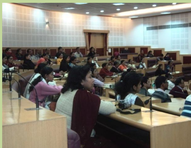
Participants of the Programme