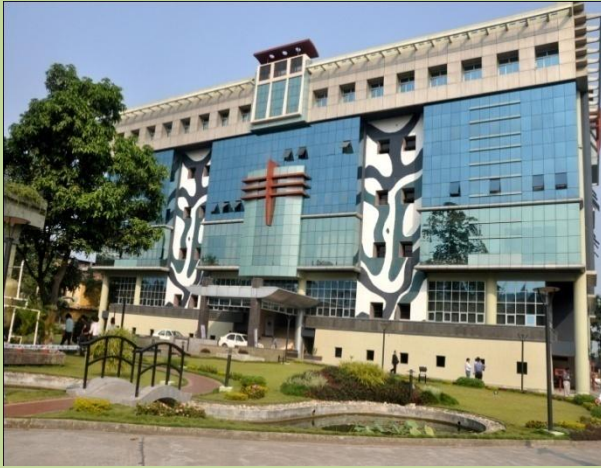
NEDFi House, Guwahati - the venue