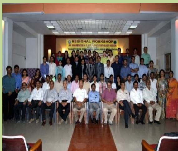
The organizing team and the participants