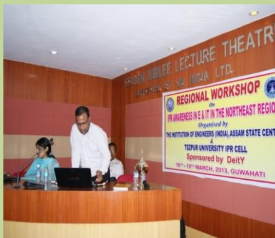
C-DAC Team demonstrating their IPR Portal and prior art search