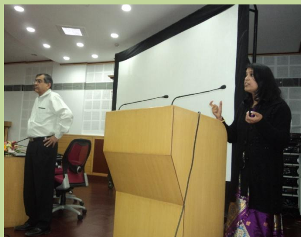
Lectures interpreted in local language