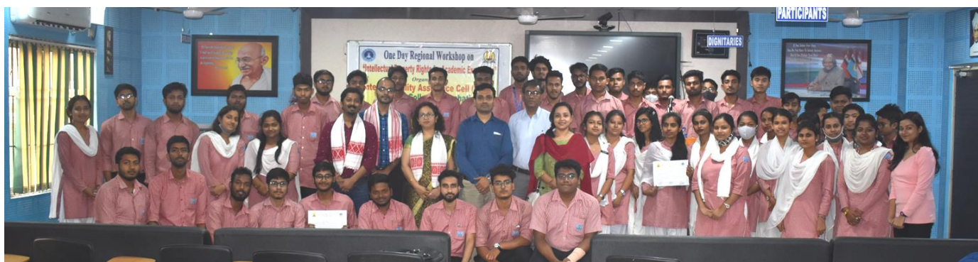
Photo: (Top left) Participants along with the members of the organizing committee from Pandu College, (top right) student participants present in the workshop and (at bottom) the group photo of the participants with the organizer and resource persons at the end of the workshop