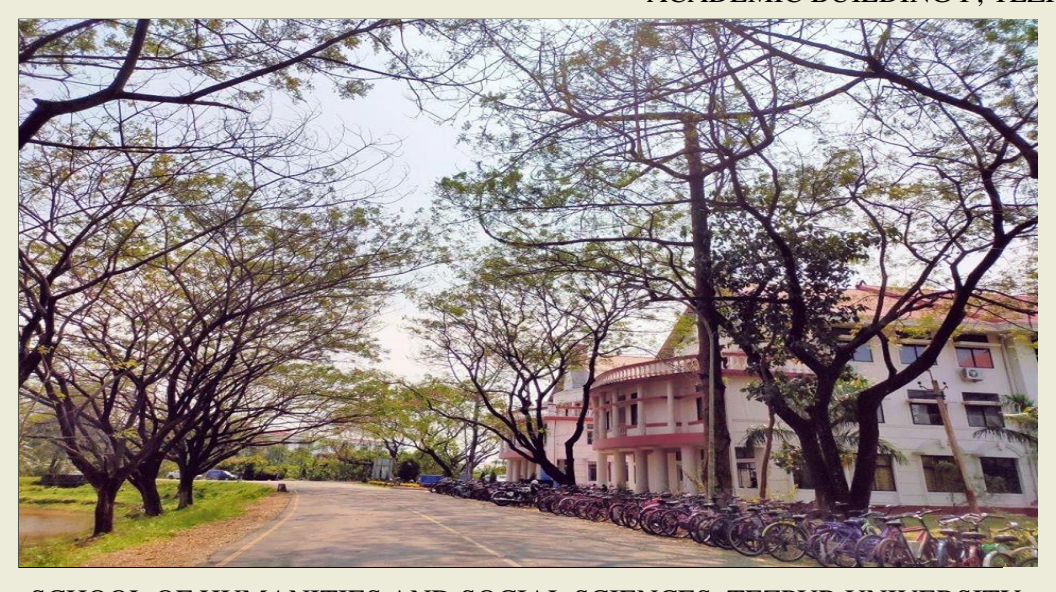
SCHOOL OF HUMANITIES AND SOCIAL SCIENCES, TEZPUR UNIVERSITY