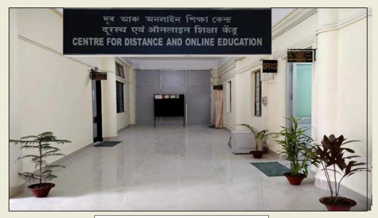
Inside view of CDOE premises formerly CODL