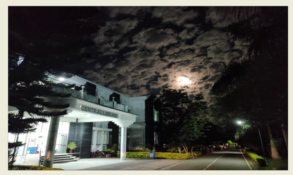
CENTRAL LIBRARY, TEZPUR UNIVERSITY