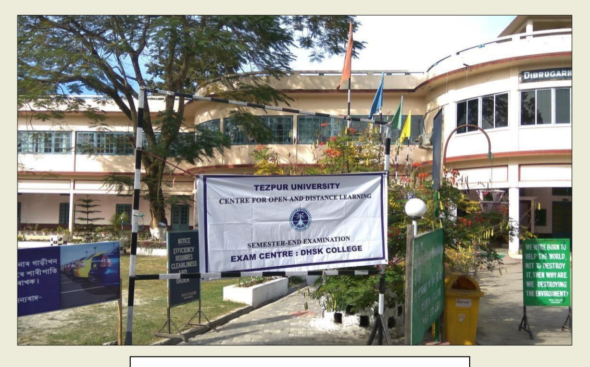
Exam Centre of CDOE at DHSK College, Dibrugarh

CDOE, TEZPUR UNIVERSITY PROSPECTUS, 2021