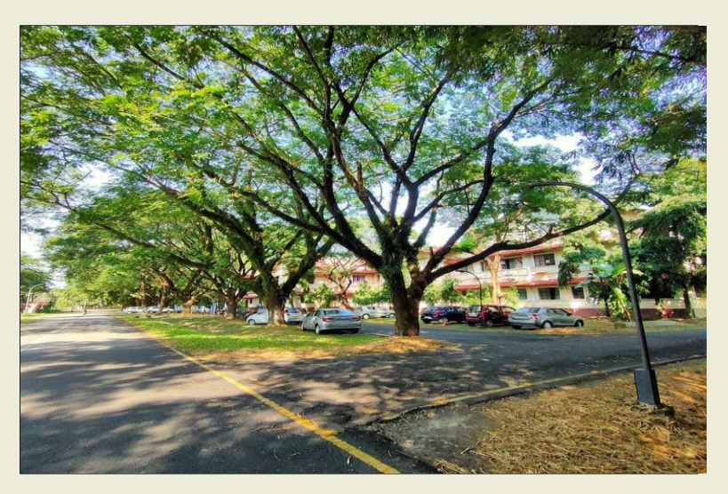
ACADEMIC BUILDING I , TEZPUR UNIVERSITY