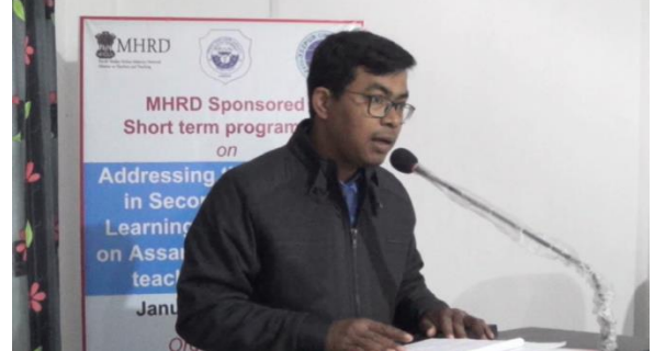
Offering vote of thanks