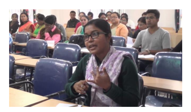
Participant interacting during a technical session