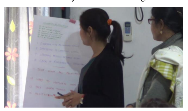
Participants taking part in activities