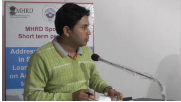
A participant sharing his experience