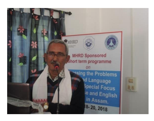
The Inaugurator's Speech