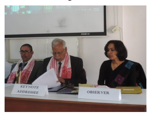
Dignitaries of the Inaugural Session