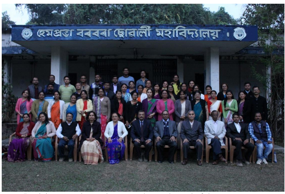
Participants and organisers together at the end of the programme