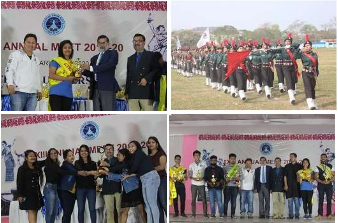
Image 3. The prize distribution ceremony and the march-past event.

The Annual Meet 2019-20 of Tezpur University is organized by the Students Council during 21 st February 2020 to 23 rd February 2019. There were both group and individual competitions. The group competitions are either Inter-Departmental or Inter-Hostel. Some of the major competition's events are Dances, Drama, Song, Literary, Debate, Photography, Fine Arts, Wall Magazine, Cultural procession etc.