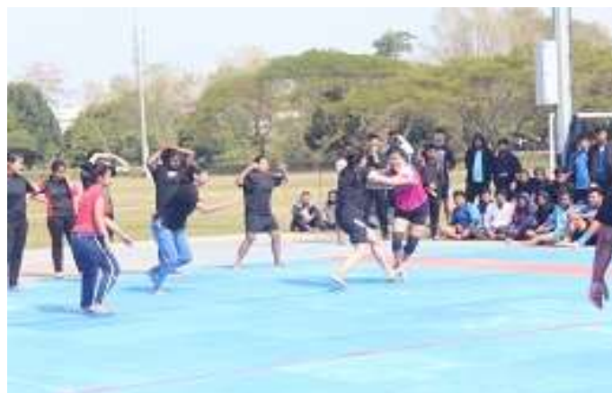
Image 2. Various events organized during the annual meet