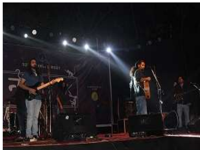
Image 4. Cultural event at the 22 nd Annual meet.

The Annual Meet 2018-2019 of Tezpur University is organized by the Students Council during 22 nd February 2019 to 24 th February 2019. There were both group and individual competitions. The group competitions are either Inter-Departmental or Inter-Hostel. Some of the major competition's events are Dances, Drama, Song, Literary, Debate, Photography, Fine Arts, Wall Magazine, Cultural procession etc.