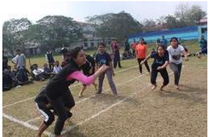
Image 3. Prize distribution and sports events of the 22 nd Annual meet.

The Annual Meet 2018-2019 of Tezpur University is organized by the Students Council during 22 nd February 2019 to 24 th February 2019. There were both group and individual competitions. The group competitions are either Inter-Departmental or Inter-Hostel. Some of the major competition's events are Dances, Drama, Song, Literary, Debate, Photography, Fine Arts, Wall Magazine, Cultural procession etc.