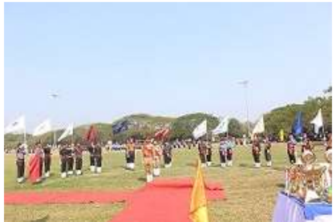
Image 2. The Prize distribution ceremony and the march-past event, 22 nd Annual Meet.