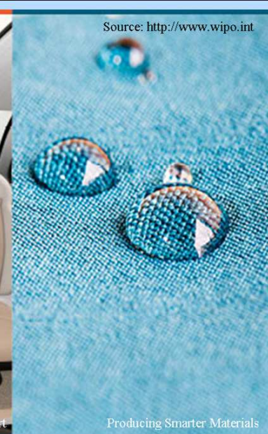
Producing Smarter Materials