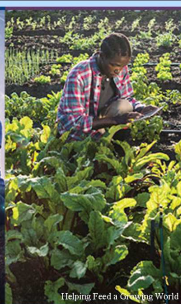
Helping Feed a Growing World