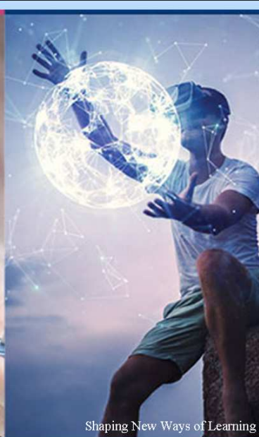
Shaping New Ways of Learning