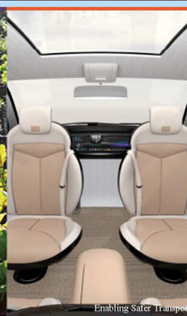
Enabling Safer Transport