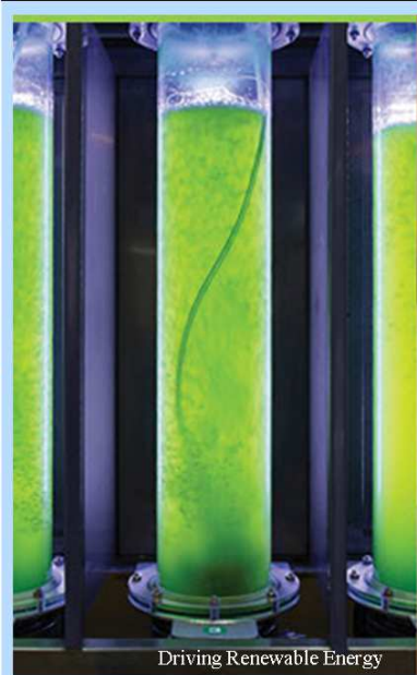
Driving Renewable Energy