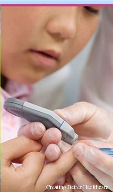
Creating Better Healthcare