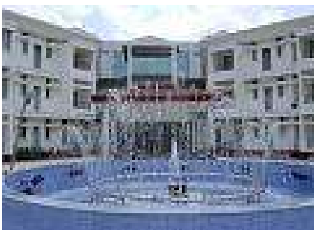
Glimpses of Tezpur University