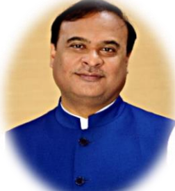
Dr Himanta Biswa Sarma Chief Minister, Assam