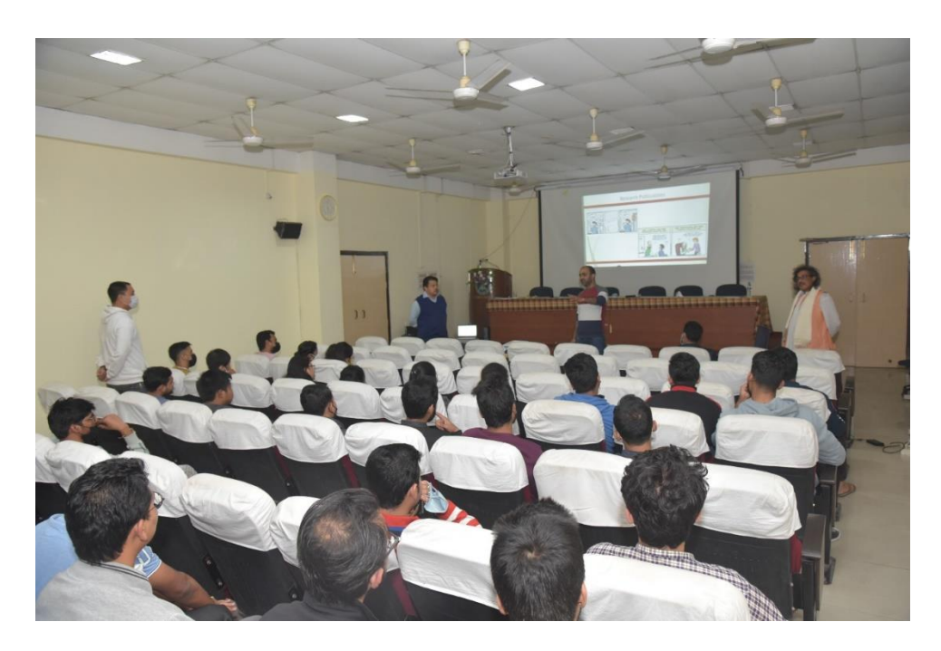
Discussion of the pannelist with the participants