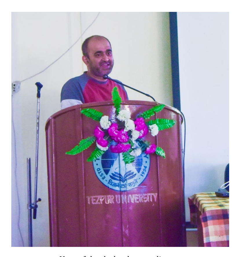
Vote of thanks by the coordinator