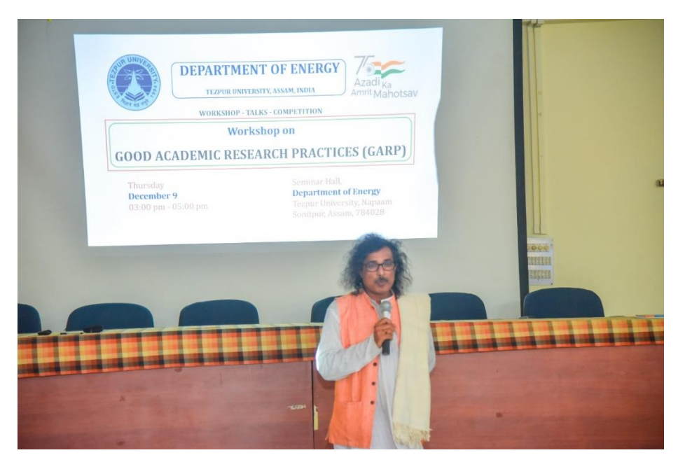
Head, Department of Energy welcoming all the participants and explain the genesis of the workshop