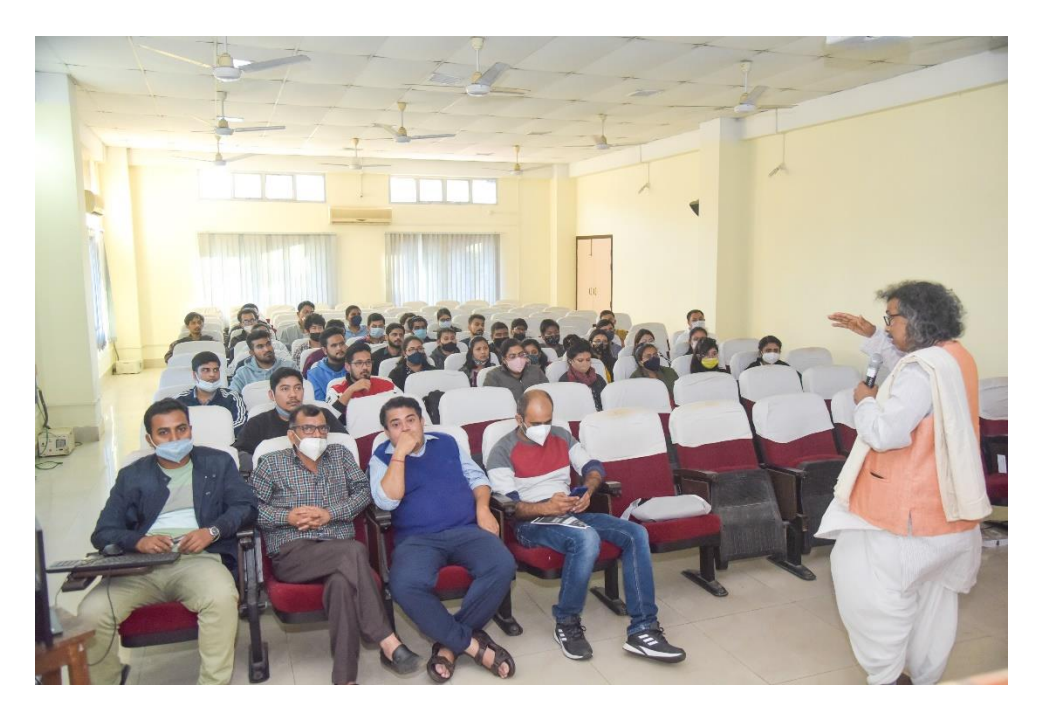
Part of the audience and participant of the workshop