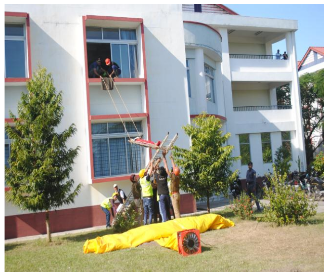
Upper rescue of seriously injured victims by ladder hinge method using stretcher