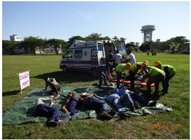
Casualty point (left) and Emergency medical response (right)