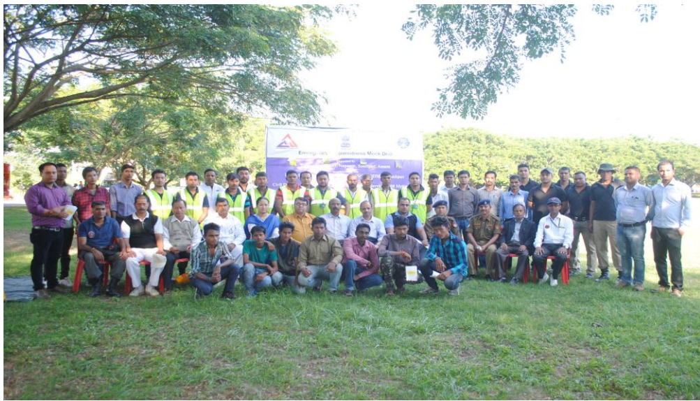
Technical staff, volunteers and University officials after the programme