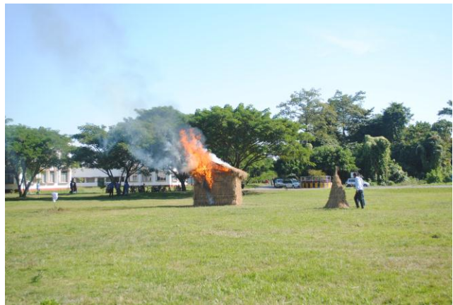
Fire in demo-hut