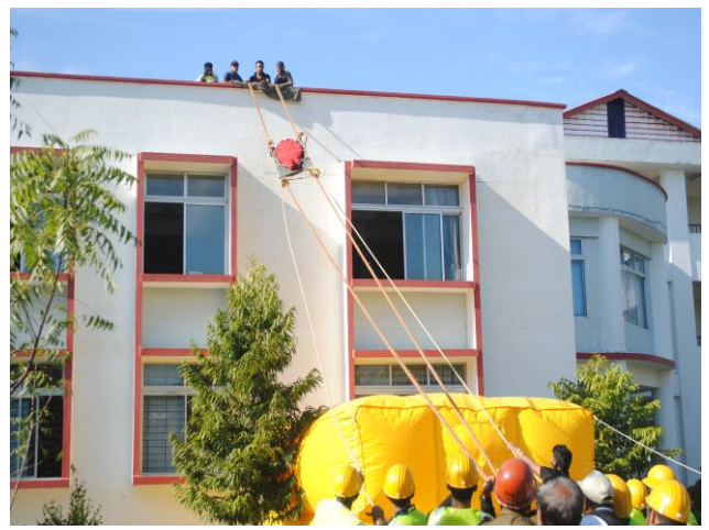
Rescue of victims from second floor by using single rope chair technique (left) and double rope slide method using stretcher (right)