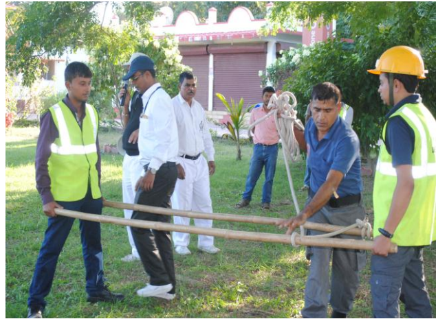
Hands-on training for selected participants of the University