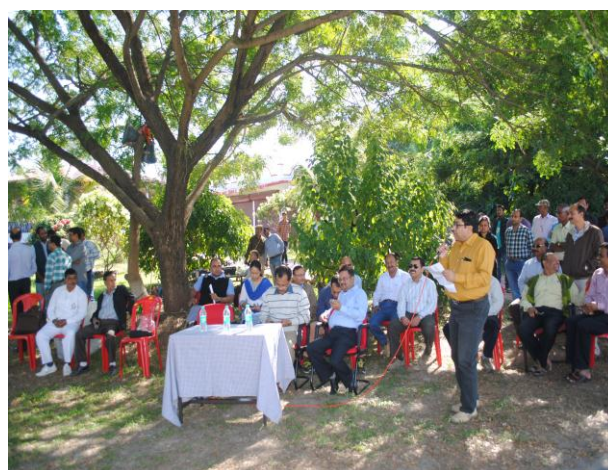
Deputy Commissioner & Chairperson, DDMA, Sonitpur graced the occasion