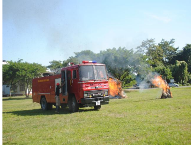
Fire and emergency service personnel are in action