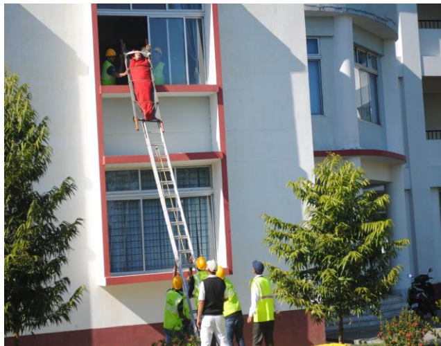
Upper rescue of seriously injured victims by ladder slide method using stretcher