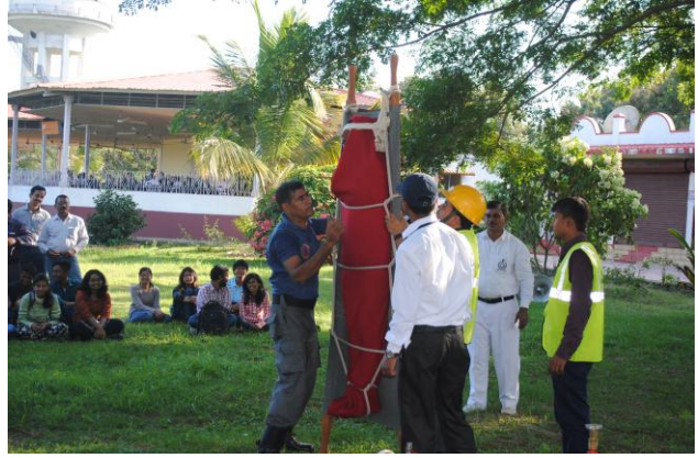
Interaction cum training session