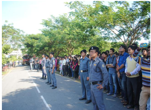
Training session (left) and section of crowd (right)