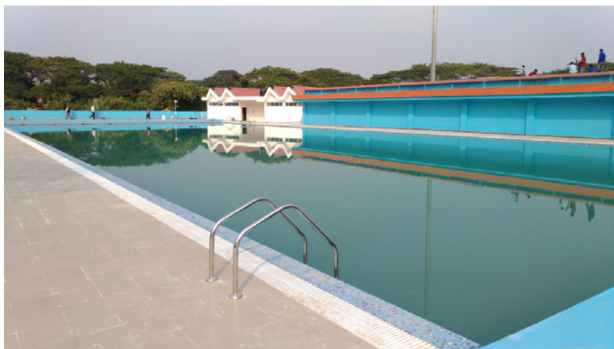
The University inaugurated a state of the art 50mx21m swimming pool for students and employees.

The University jointly with Kaliabor Sub-Divisional Administration organised a three-day summer camp for the students belonging to rural background schools of Kaliabor sub-division during the month of July.