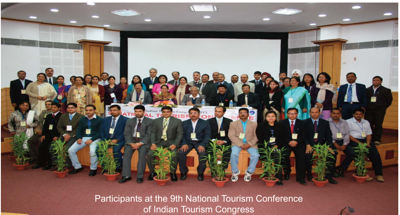
Participants at the 9th National Tourism Conference of Indian Tourism Congress