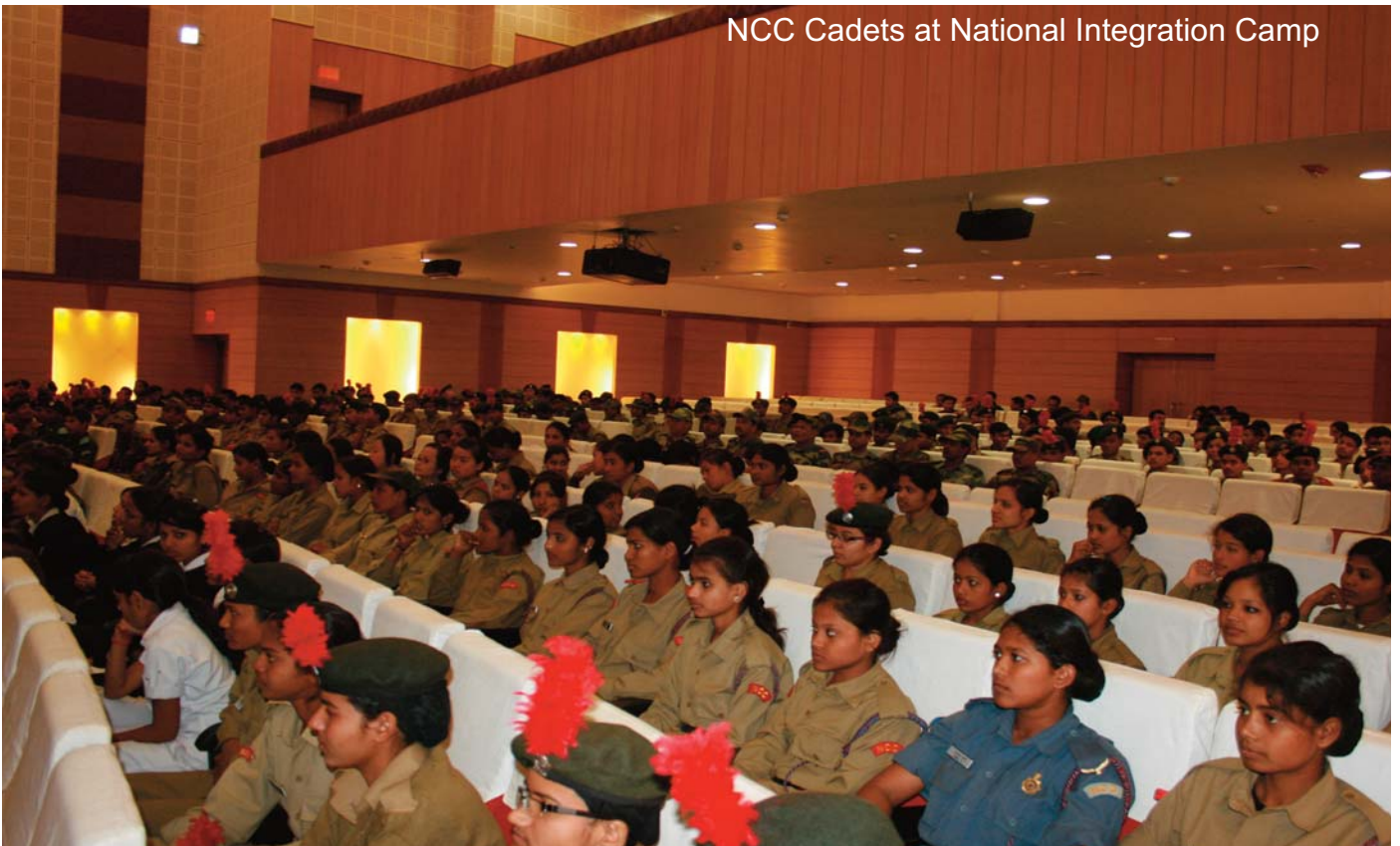
NCC Cadets at National Integration Camp

On August 19 the Department of Cultural Studies