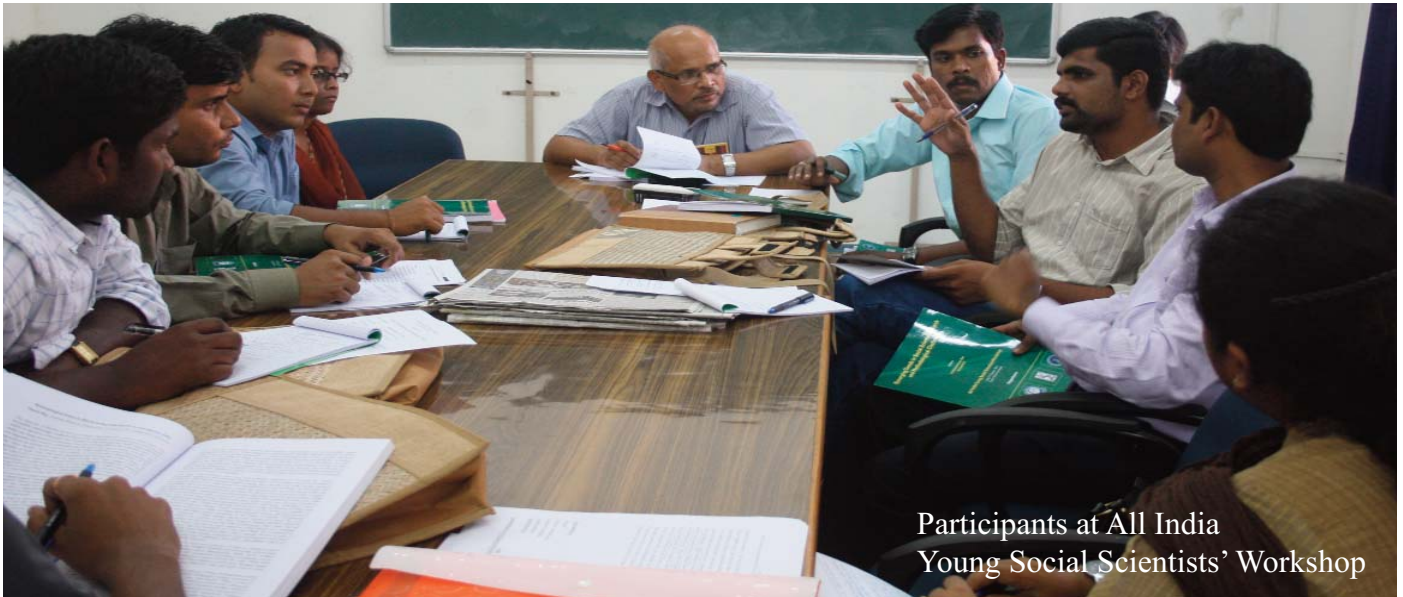
Participants at All India Young Social Scientists' Workshop