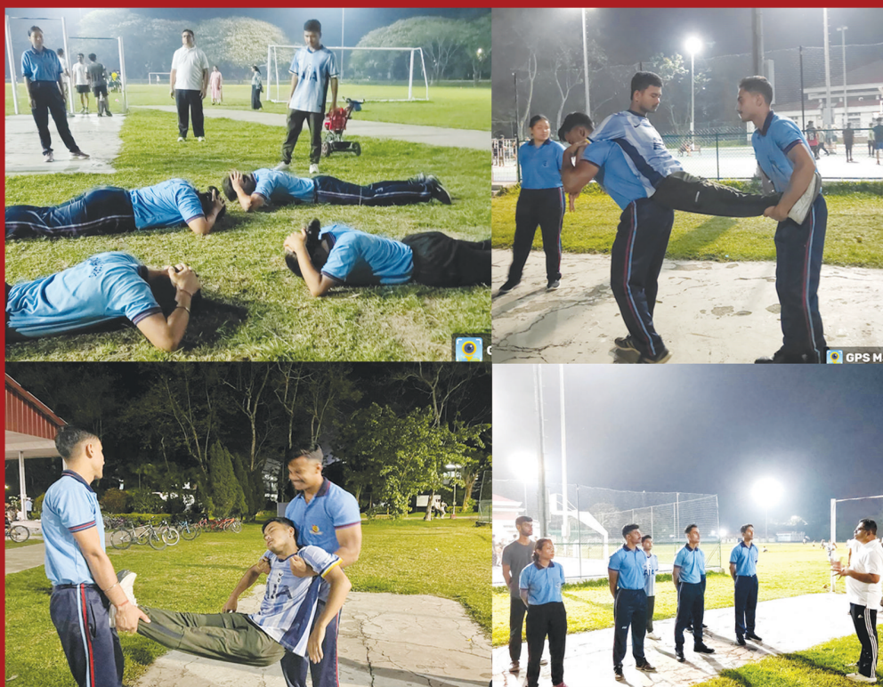
Tezpur University NCC cadets performed a Civil Defence Mock Drill, simulating emergency scenarios. The mock drill was conducted during 'Operation Sindoor' to enhance coordination during emergency situations