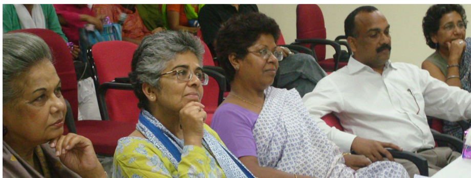
The workshop was sponsored by Tezpur University and ICSSR.

Workshop on Empowerment of Women through Media, organized by Tezpur University's Affirmative Action and Equal Opportunity Project, the Department of Mass Communication and Journalism, and Network of Women in Media, India on 24 and 25 March, 2008.